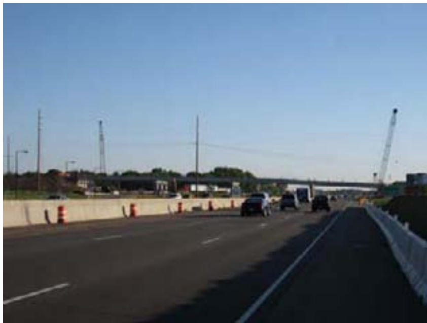
A view from northbound I-35 after beam erection