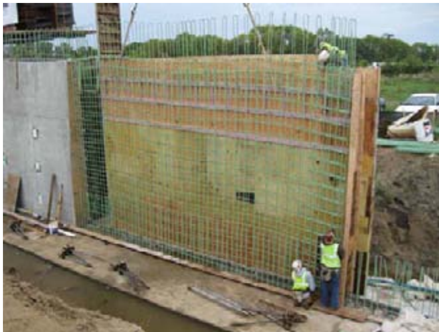
Iron workers setting a pre-tied steel cage for panel 4 of the north retaining wall