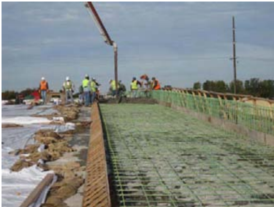
A look at the sidewalk concrete pour