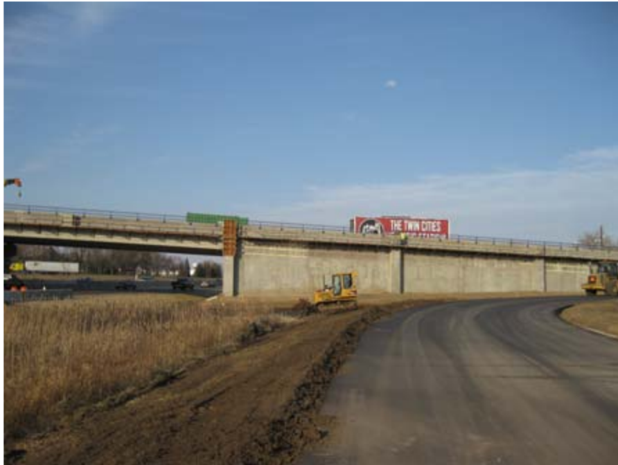
Shaping slopes on Eureka Avenue