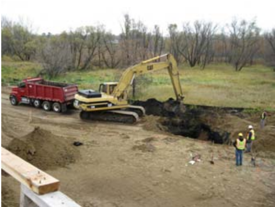
Muck excavating on Eureka