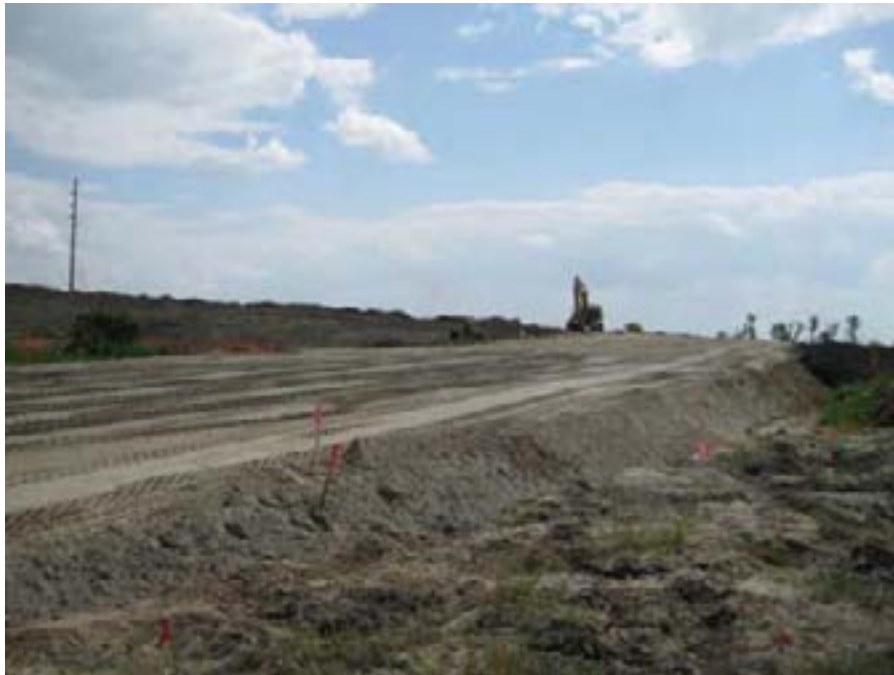
An early view of the CR 83/Everton intersection looking south on Everton