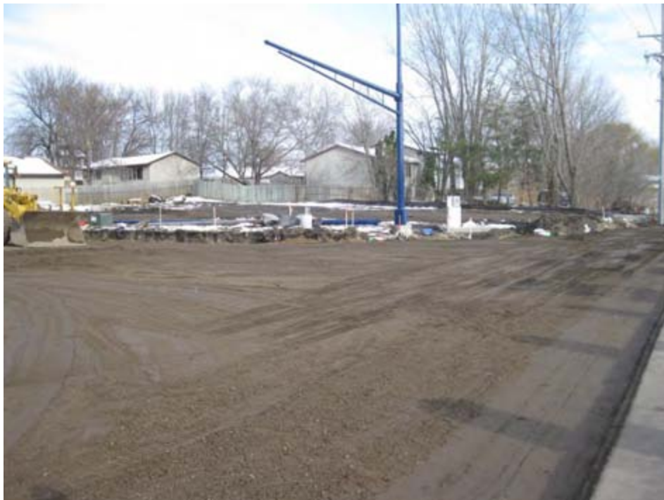
Gravel being placed at the CR 83/12 th Street intersection