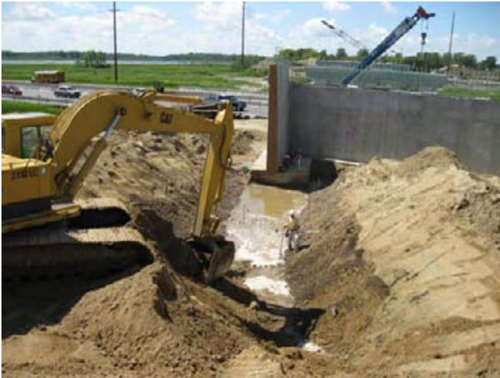
Forest Lake Contracting excavating for the south retaining wall