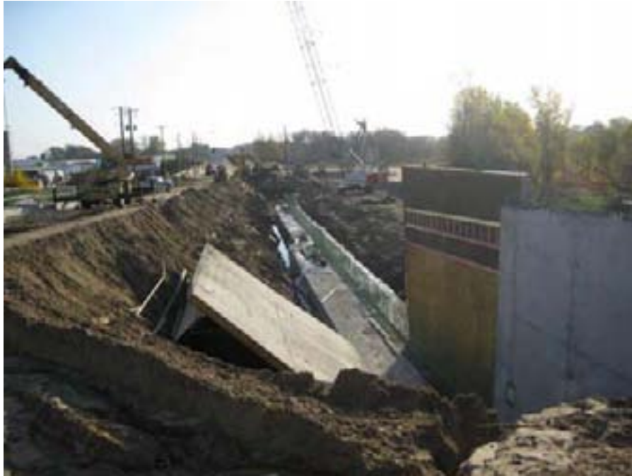
A look at the progress made this week on the south retaining wall