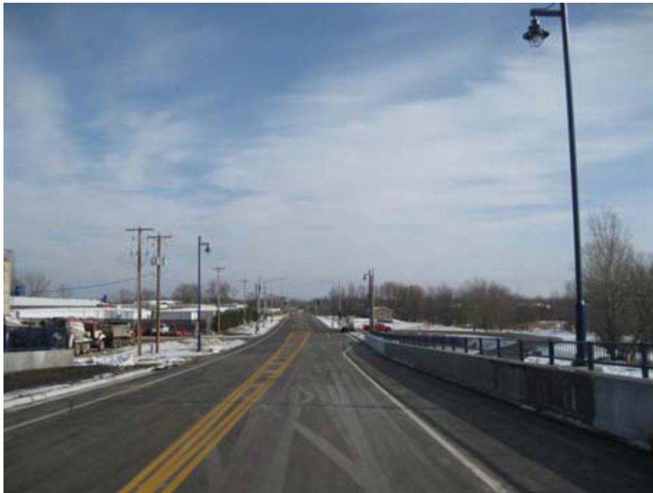
A look at the striping and lighting work on CR 83 east of the bridge