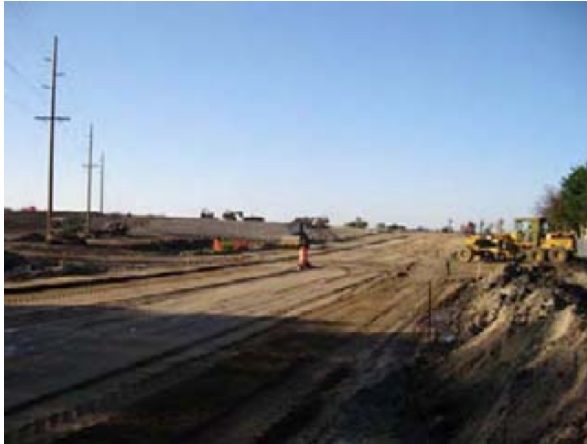
A view looking south towards the CR 83/Everton intersection