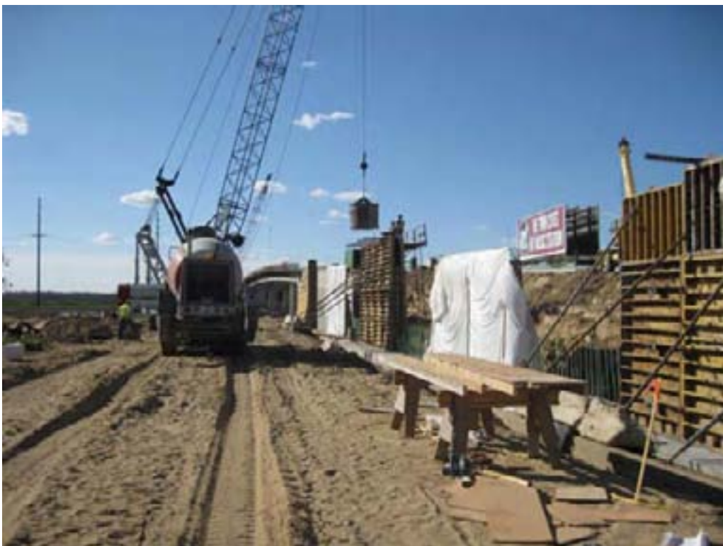
Concrete pour for panel 5 of the south retaining wall