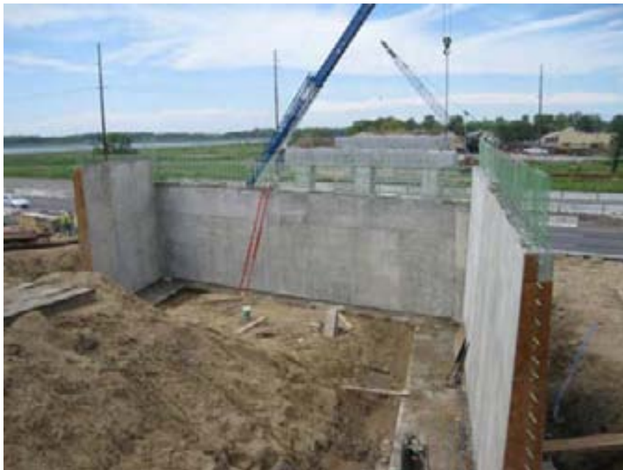
A view from panel 3 of the north retaining wall looking west