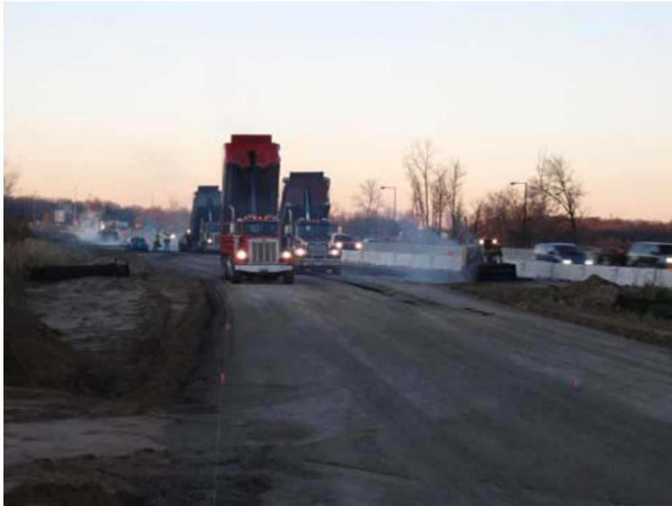
Paving the temporary northbound off-ramp of I-35