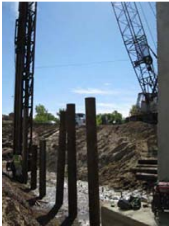
Pile driving for the south retaining wall