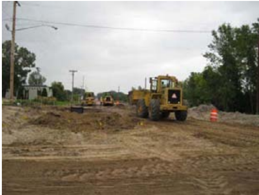
Subcut work at the CR 83/15 th Street intersection