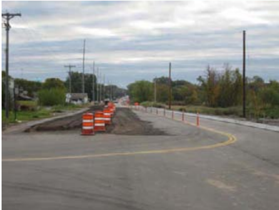
A look at CR 83 between 15 th Street and 12 th Street