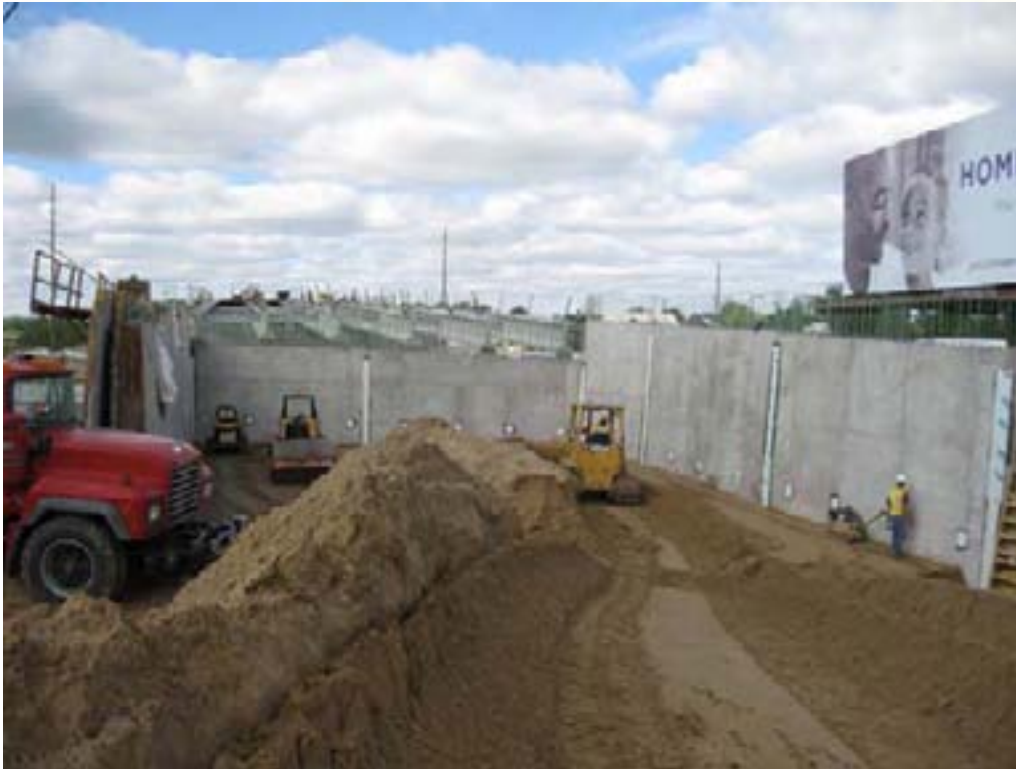
Backfilling at the east abutment