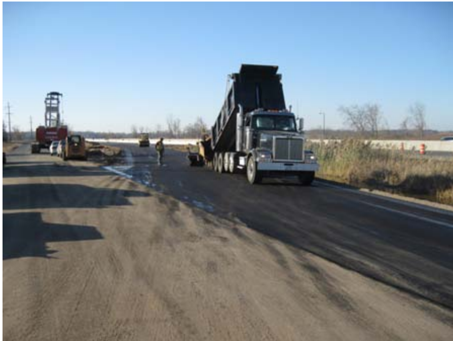
Paving the final lift of wear course on the temporary northbound off-ramp