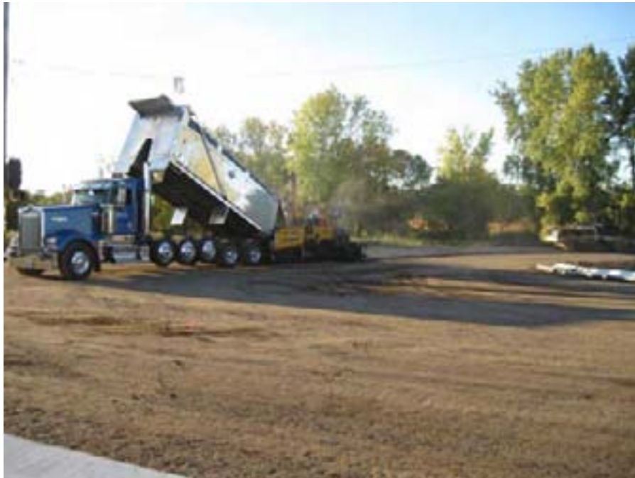
Paving the first lift of asphalt at the CR 83/Eureka intersection