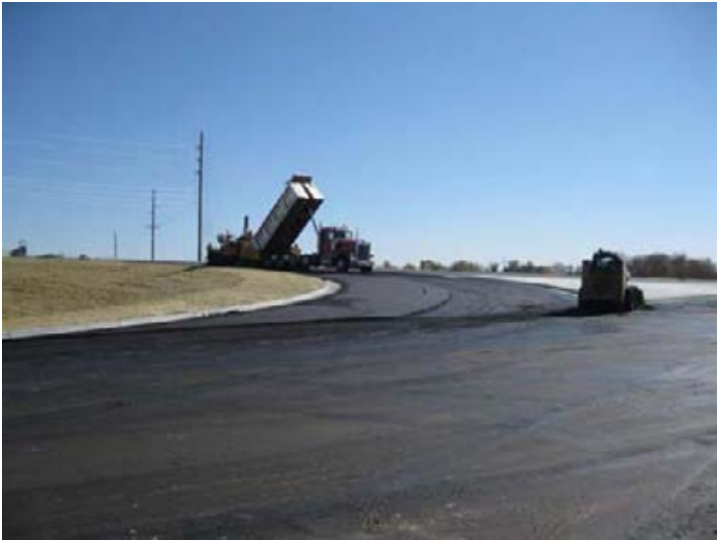
A look at the paving operation at the CR 83/Everton intersection