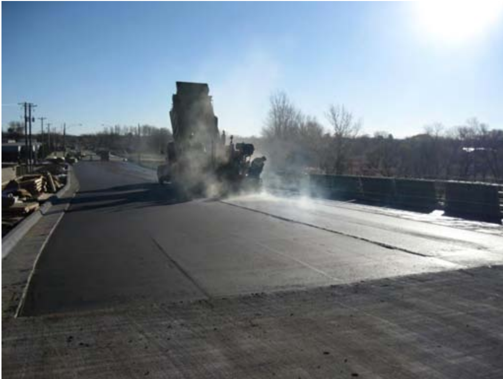
Paving the east bridge approach on CR 83