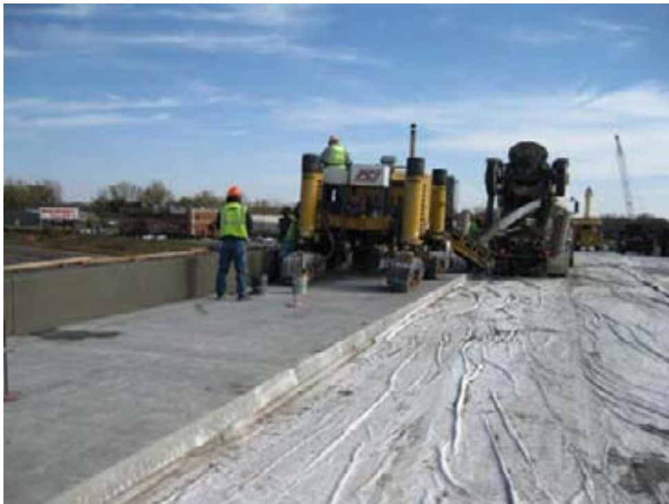
Slipforming the north rail on the bridge deck