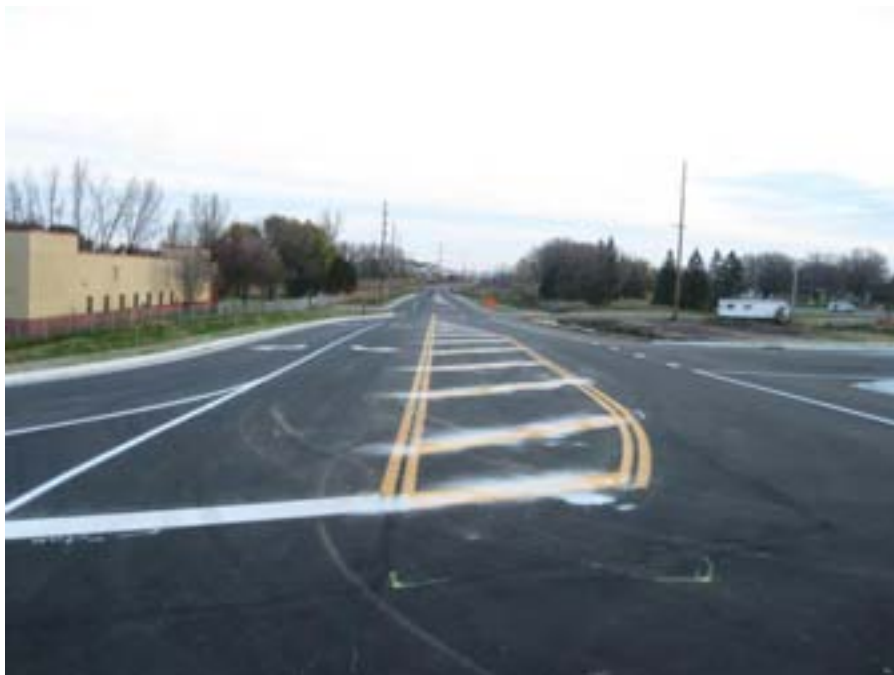
A look at the permanent striping on Everton