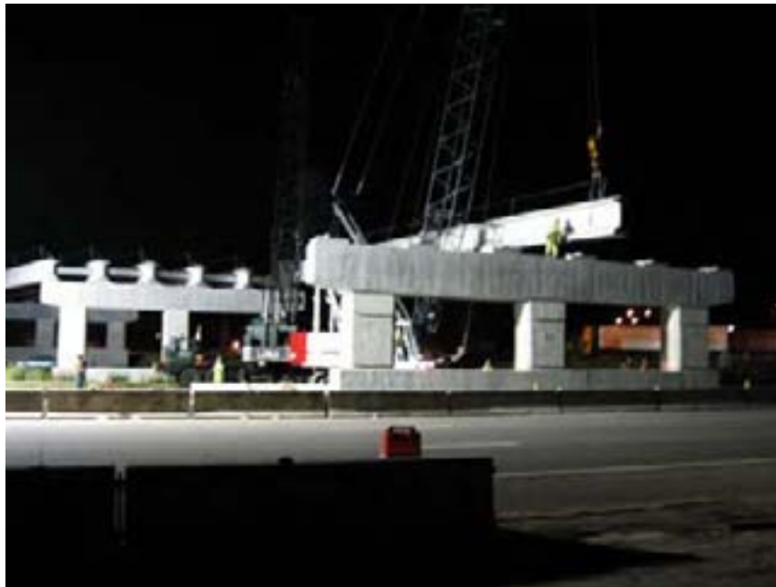
Beam setting for Span 3 (Pier 2 to Pier 3)