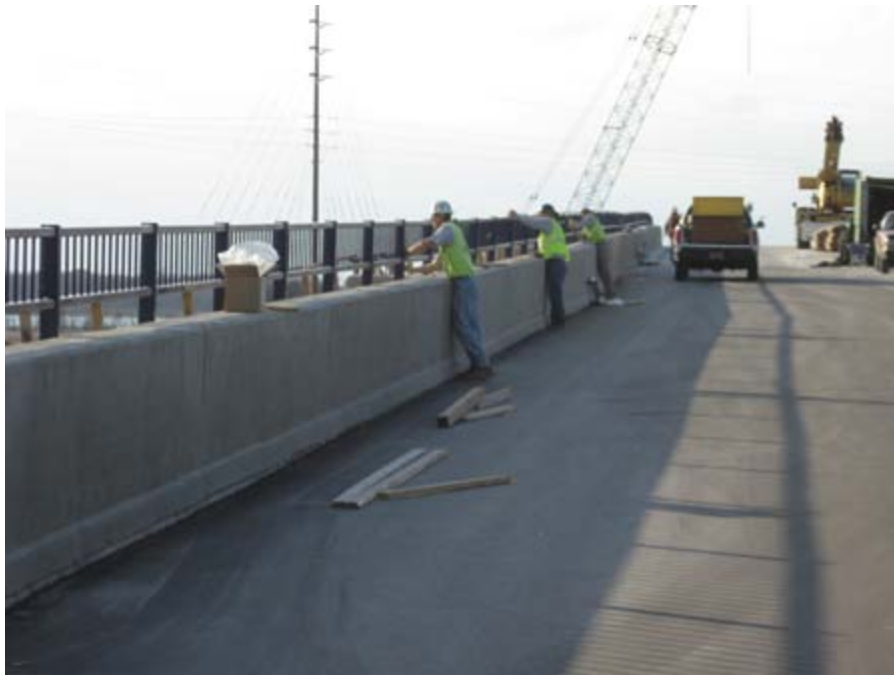
Installation of structural tube rail on the south side of the bridge