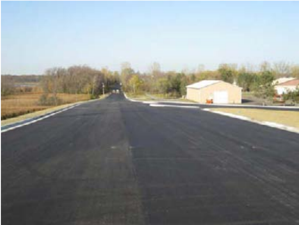
A look at the nearly completed roadway on CR 83 on the west side of the project, prior to striping