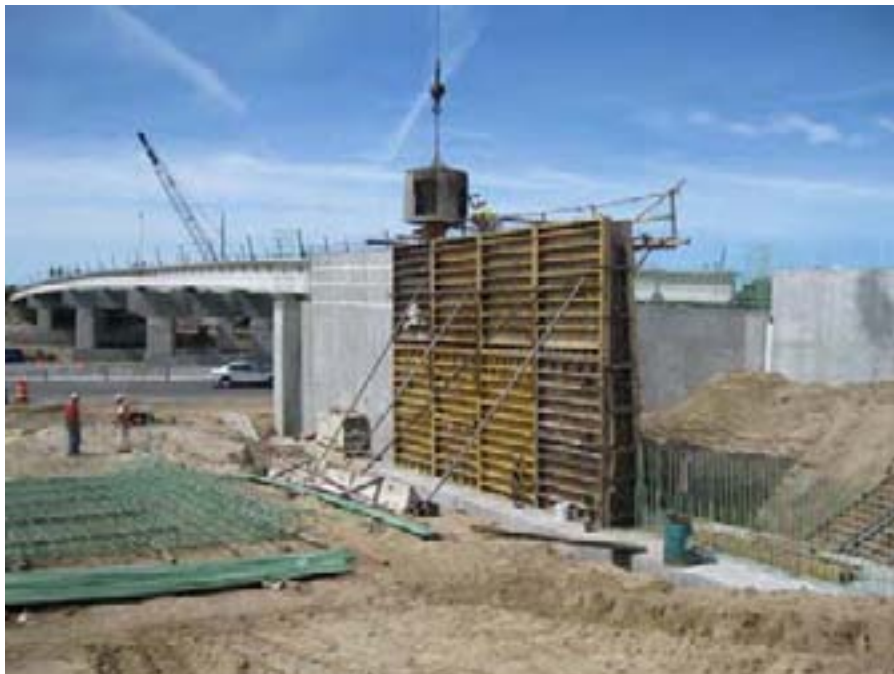
Concrete pour for panel 1 of the south retaining wall