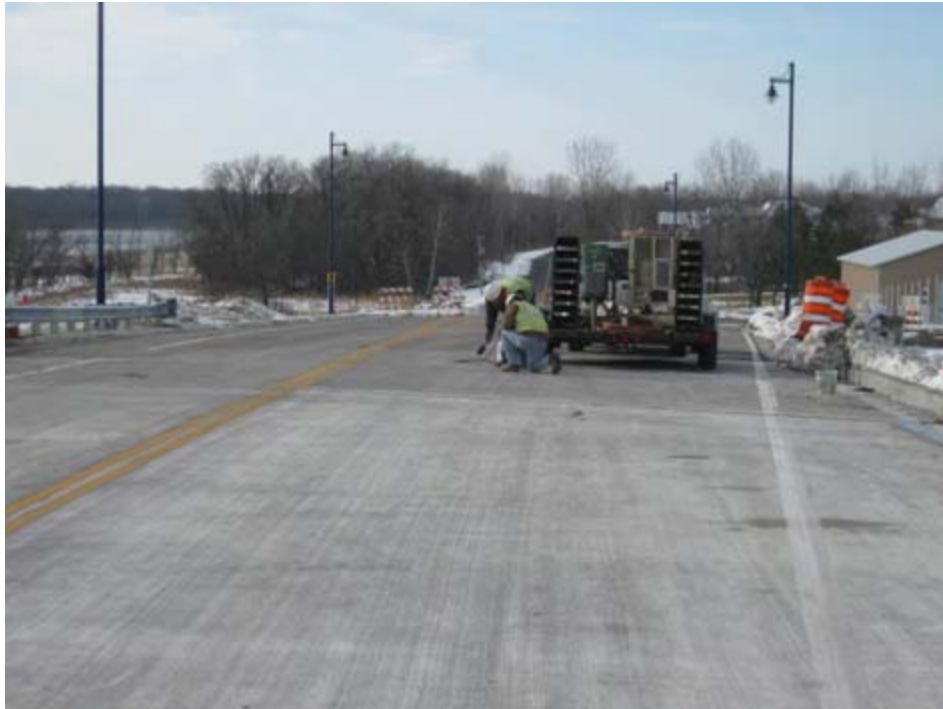
Sealing joints at the west approach panel