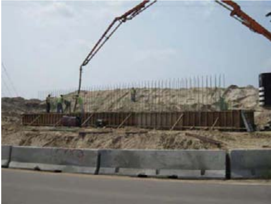
Pumping concrete for the west abutment footing