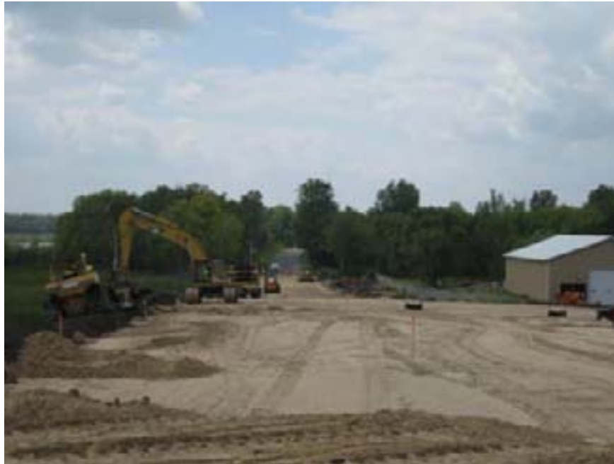
A view from the west abutment, looking west down CR 83