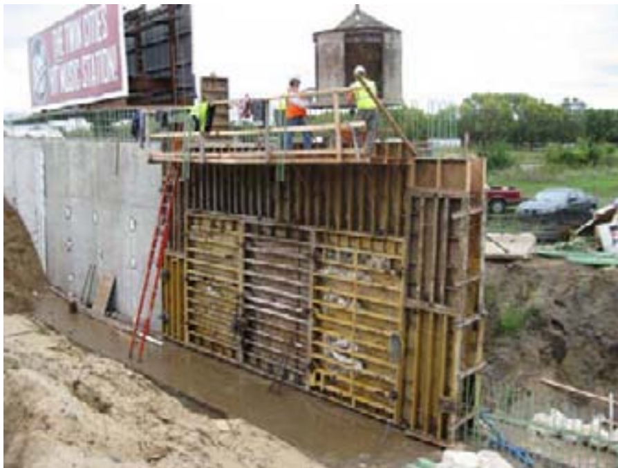
Concrete pour of panel 4 of the north retaining wall