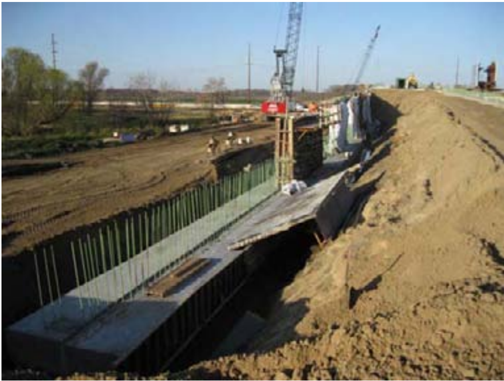
A look at the progress made on the south retaining wall this week, which included 7 panel pours