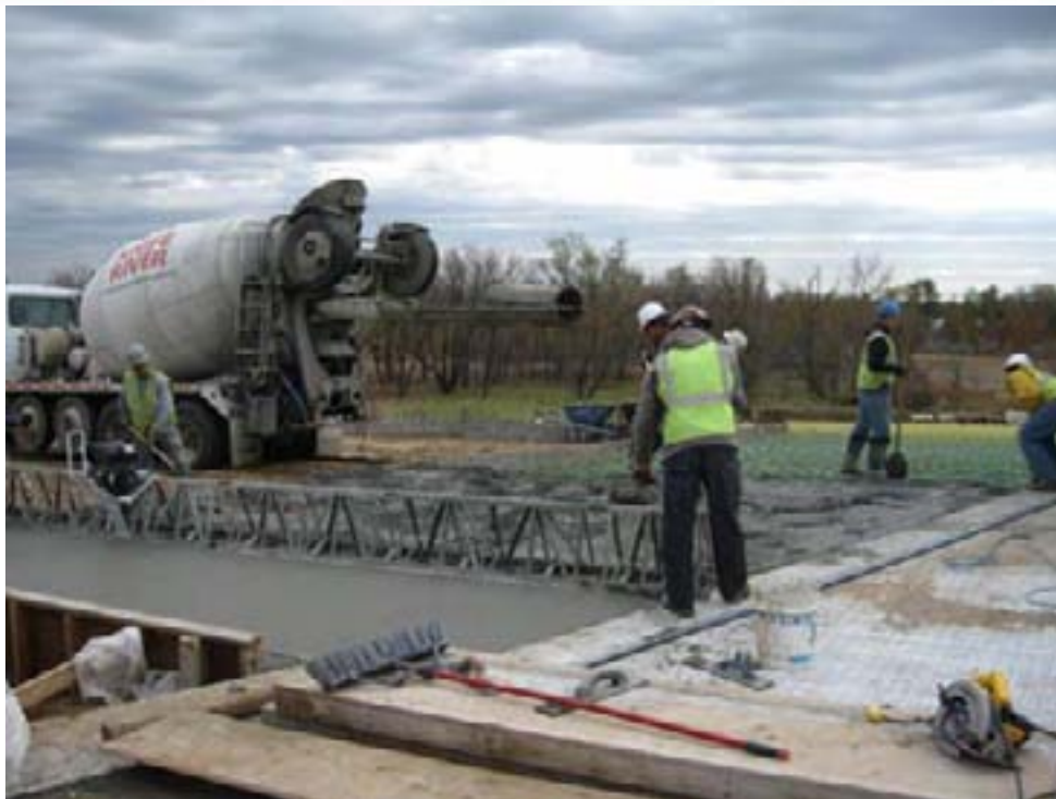
Concrete pour for the first half of the east approach panel