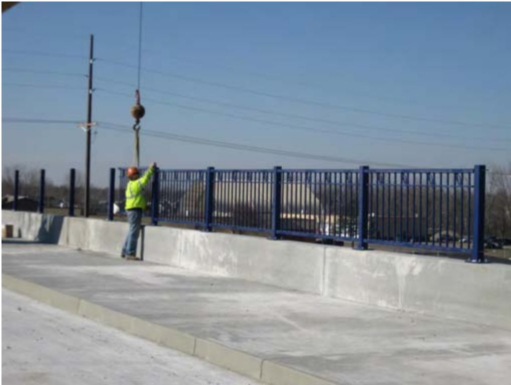
Setting ornamental rail on the north side of the bridge