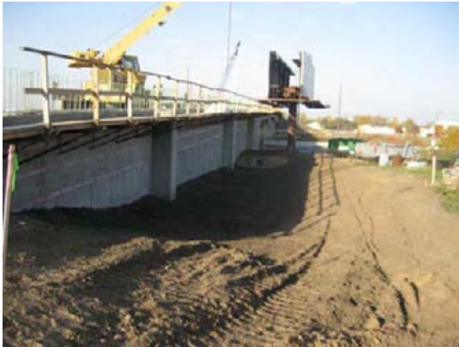
A look at the north side slope of the north retaining wall