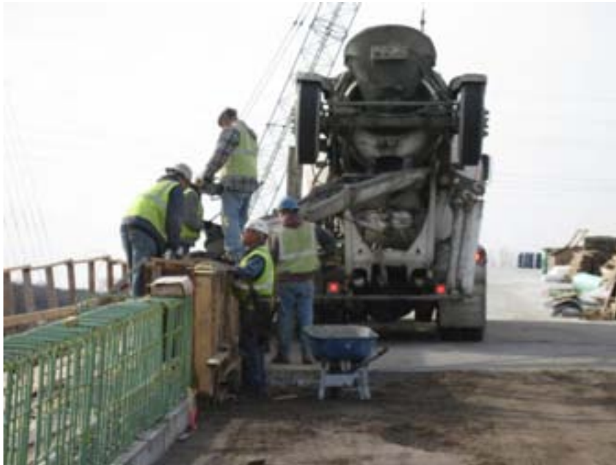
Concrete pour of the railing at the southeast wing wall