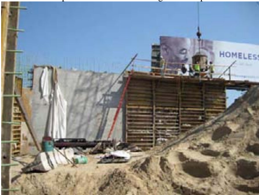
Concrete pour for the first panel of the north retaining wall