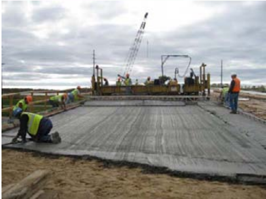
The south half of the deck overlay pour