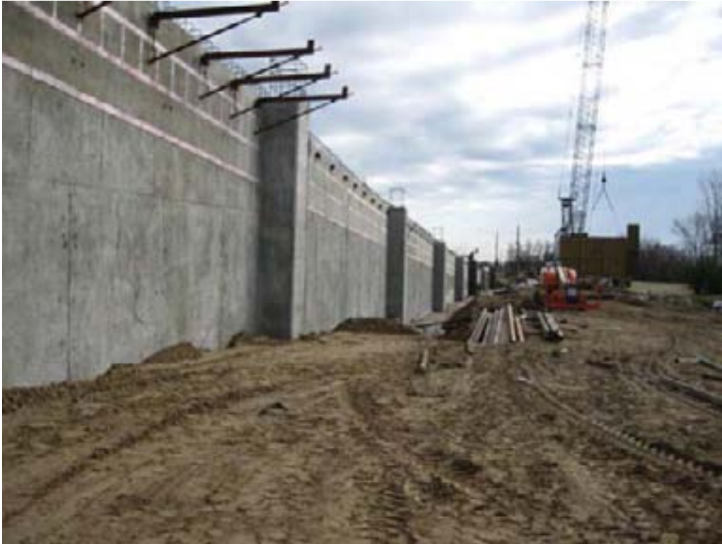
A look down the front face of the south retaining wall