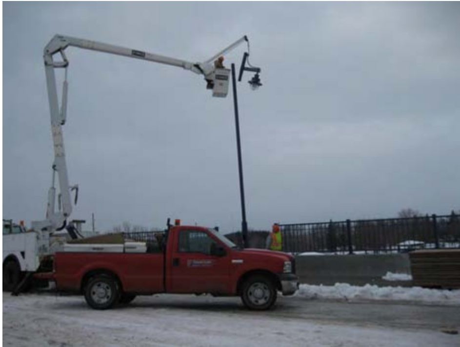
Installation of a light pole on the north side of the bridge