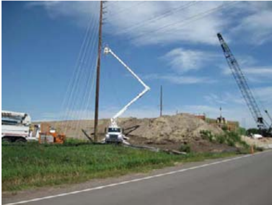
Connexus Energy stringing lines over the west embankment