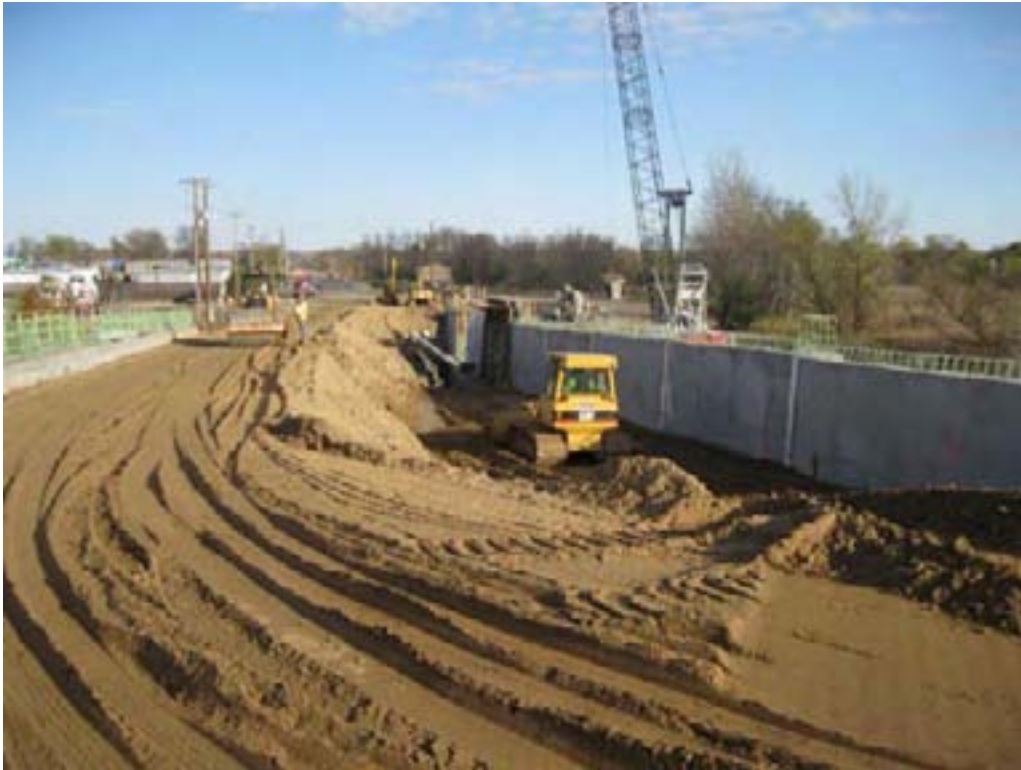
Backfilling at the south retaining wall