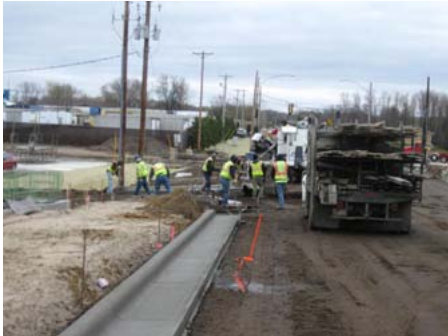
Pouring curb and gutter for CR 83 on the east bridge approach