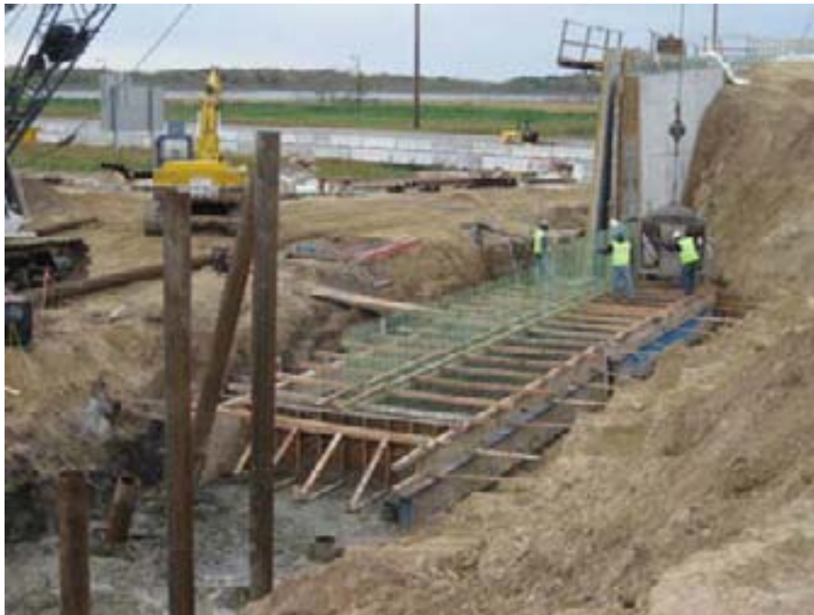
Concrete footing pour for panels 3 and 4 of the south retaining wall