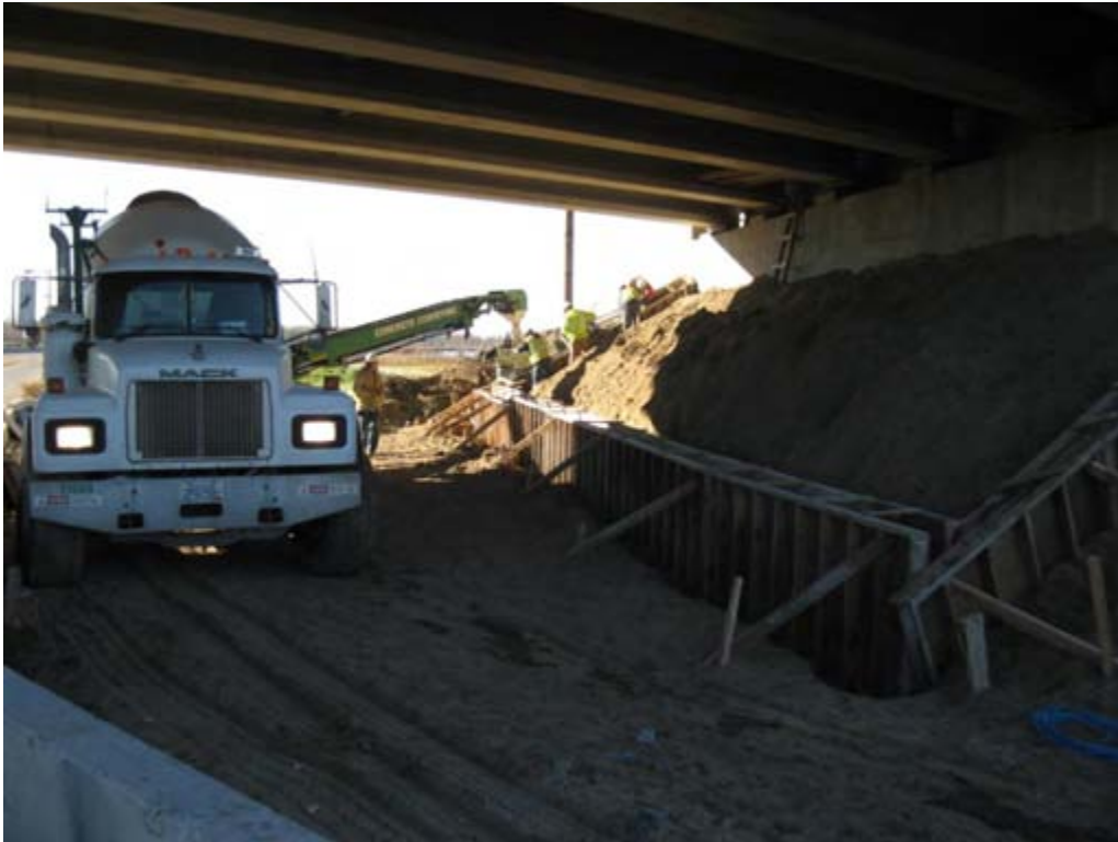
Concrete pour of the toe and side walls of the west abutment slope paving