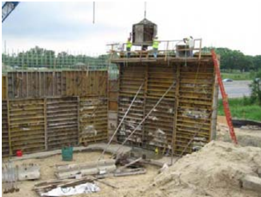
Concrete pour of the north wingwall of the east abutment