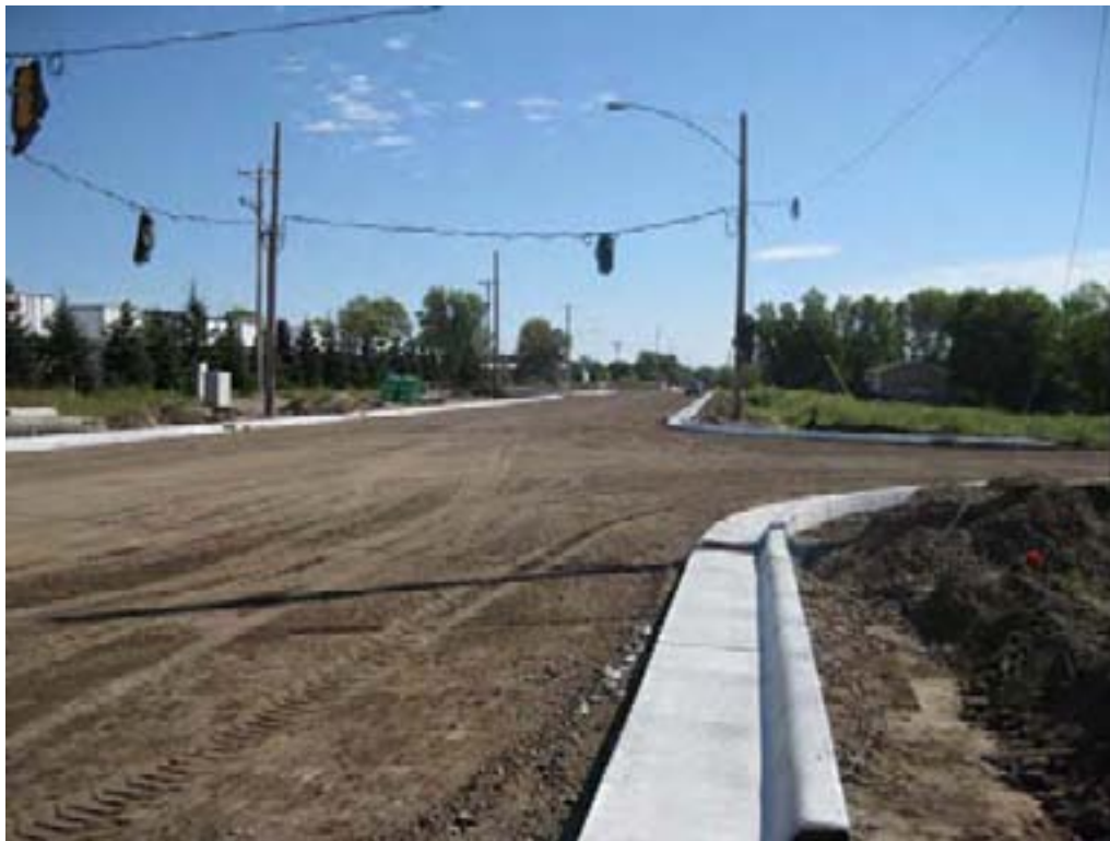
A look at the finished curb and gutter looking east at the CR 83/Eureka intersection