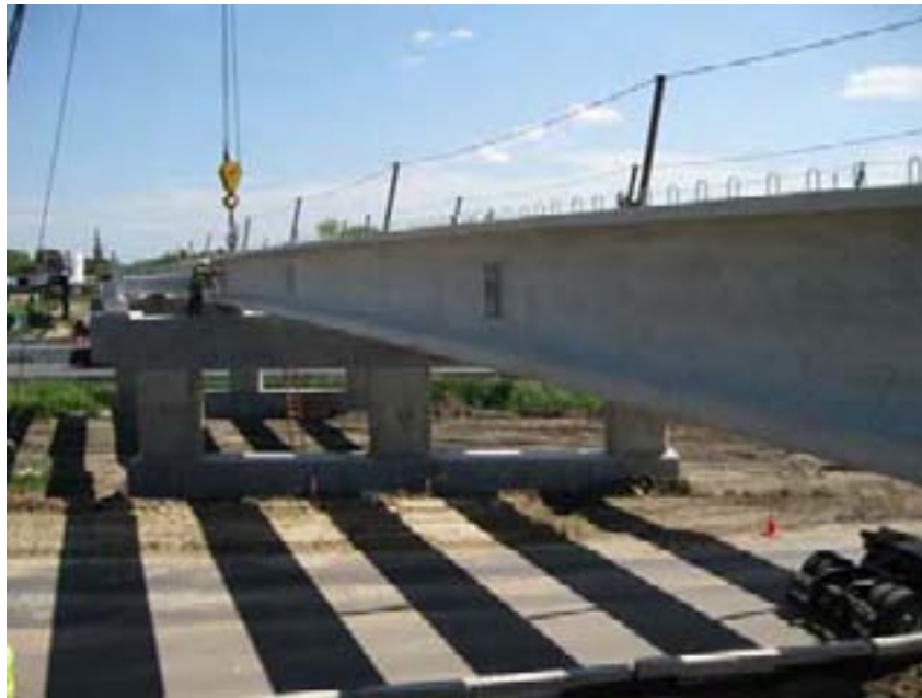
Beam setting for Span 1 (West Abutment to Pier 1)