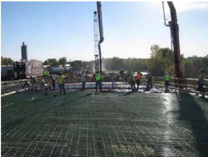
R.R. Schroeder workers pouring the bridge deck