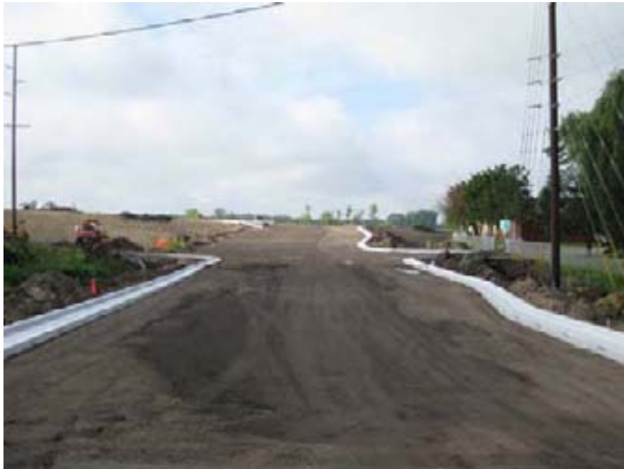
A view looking north towards CR 83 of the curb and gutter on Everton