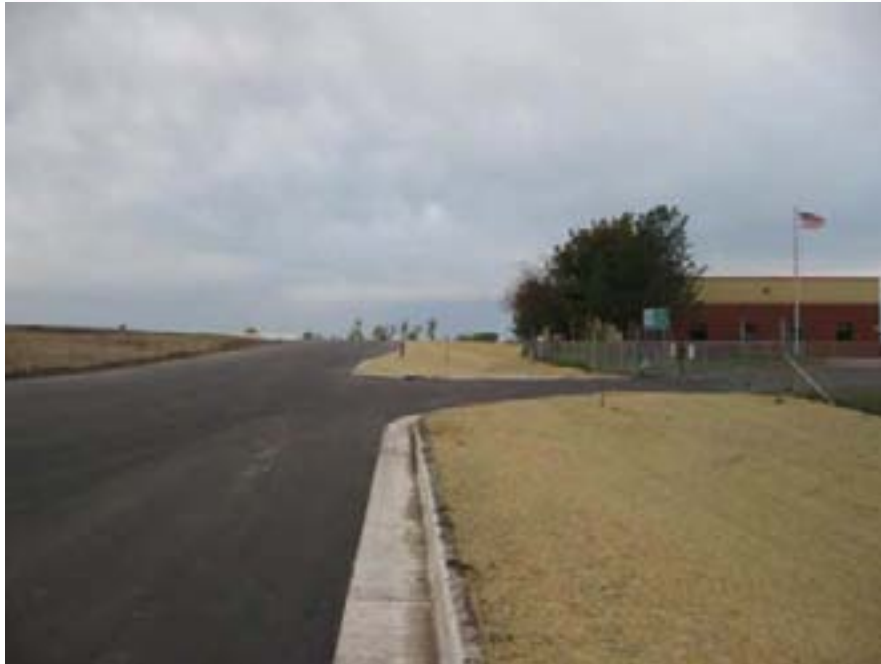
Seed and fertilizer are protected under a straw blanket on Everton