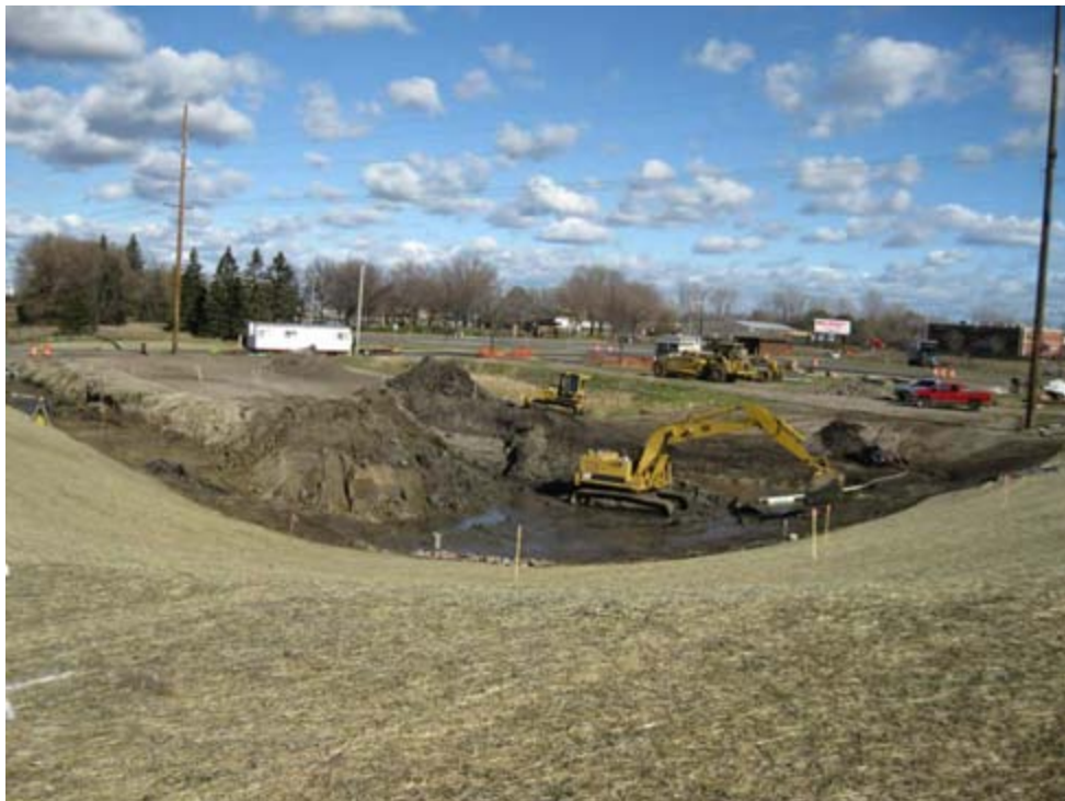
Excavating the rest area pond near the CR 83/Everton intersection