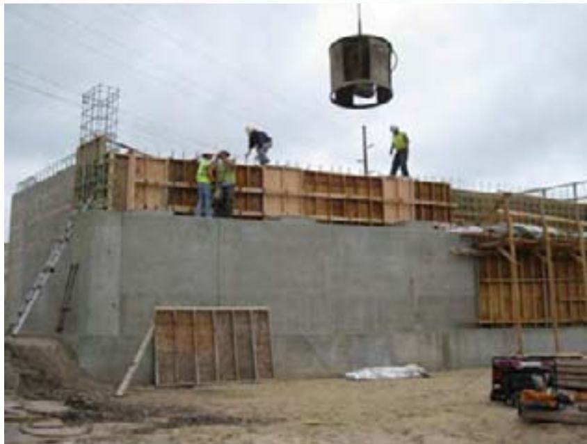
Concrete pour of the south half of the parapet