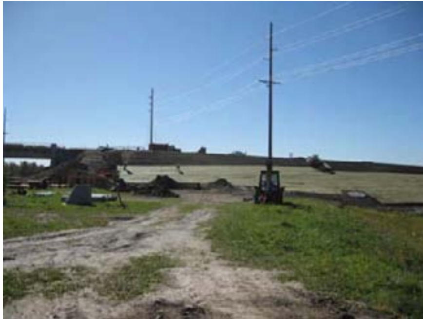
Installation of straw blanketing on the north side slope of CR 83 on the west side of the project