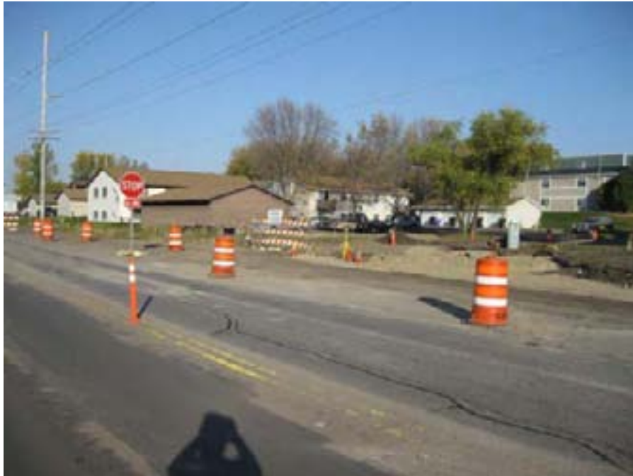
The closed intersection of CR 83/12 th Street prior to utility relocations