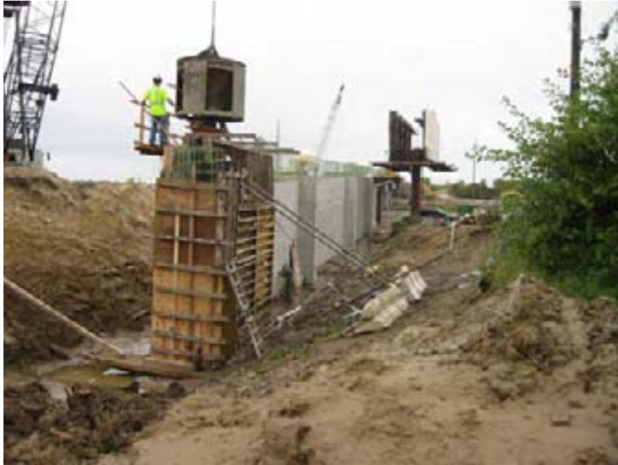
Concrete pour of the 7 th and final panel of the north retaining wall