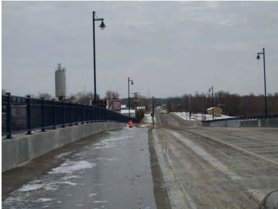
A view looking east from the CR 83 Overpass