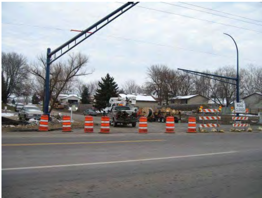
A look at the paved CR 83/12 th Street intersection