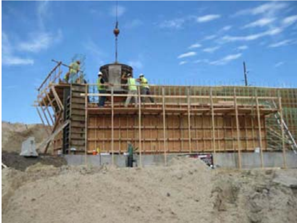
R.R. Schroeder workers pouring concrete at the west abutment