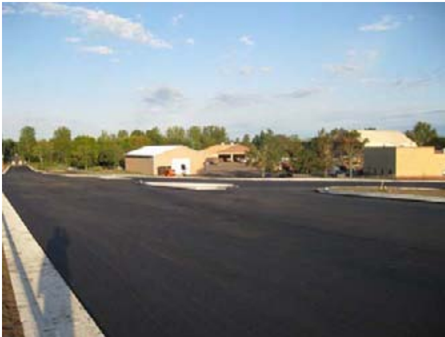
A look at the CR 83/Everton intersection after the first lift of blacktop