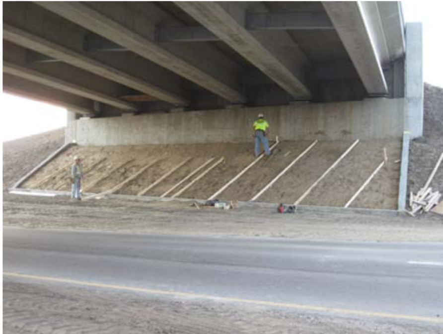
Setting forms for the slope paving at the west abutment