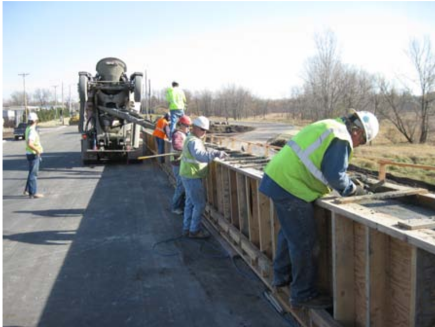
Constructing rail on the south retaining wall