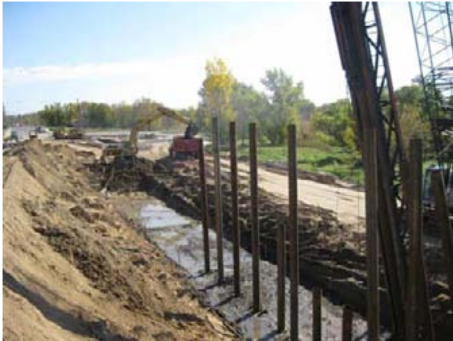
A look at Forest Lake Contracting excavating for the south retaining wall