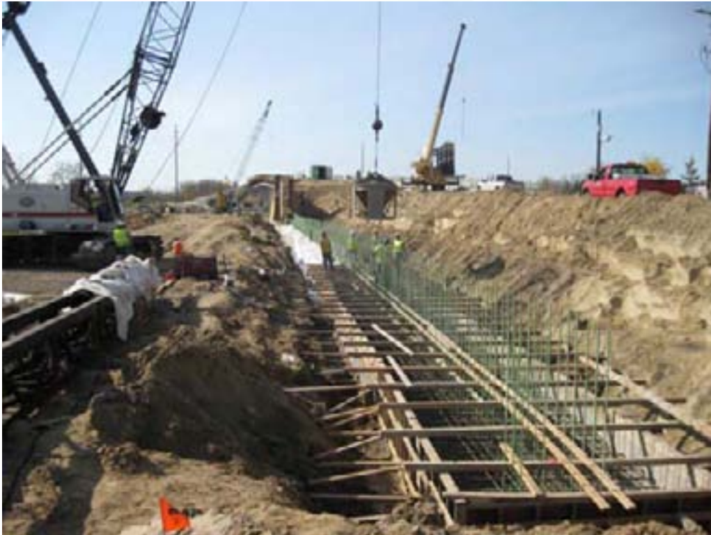
Concrete pour of the remaining segment of footing at the beginning of the week