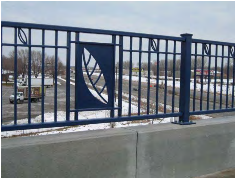
A close-up look at the ornamental rail on the north side of the bridge