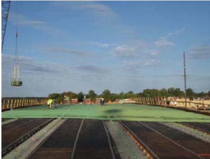
Iron workers tying the deck mat