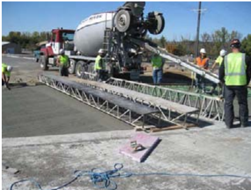
Concrete pour of the first half of the west approach panel