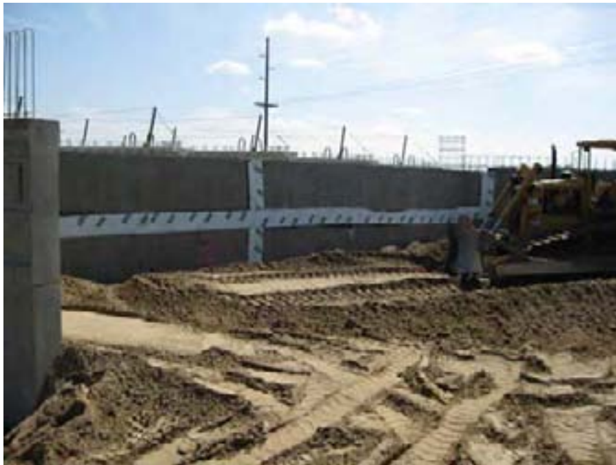
Backfilling the west abutment