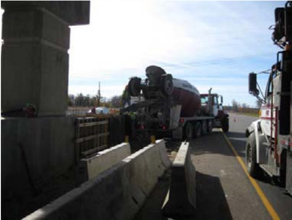
Pouring concrete for the I-35 median crash barrier