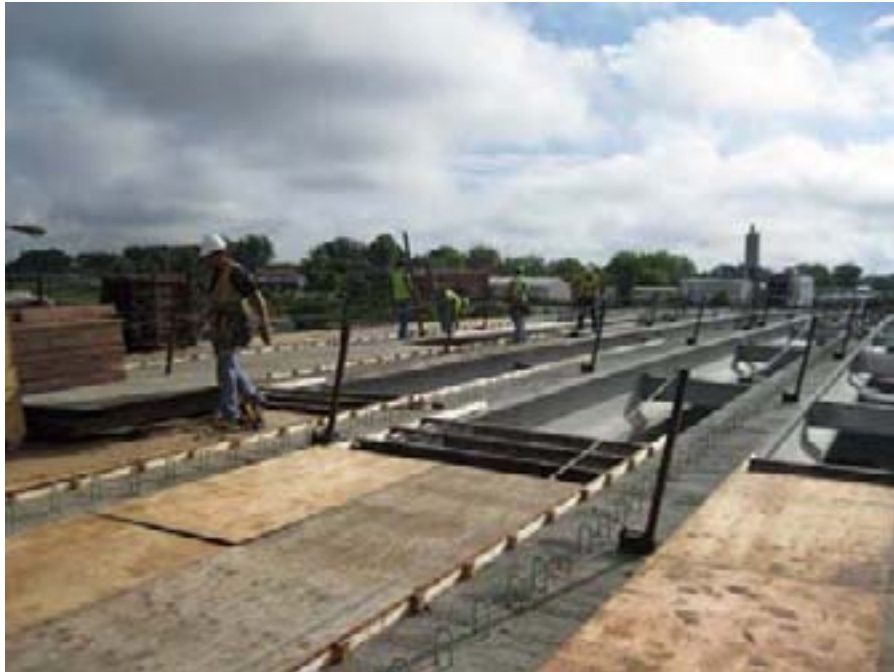
R.R. Schroeder workers decking the first bridge span